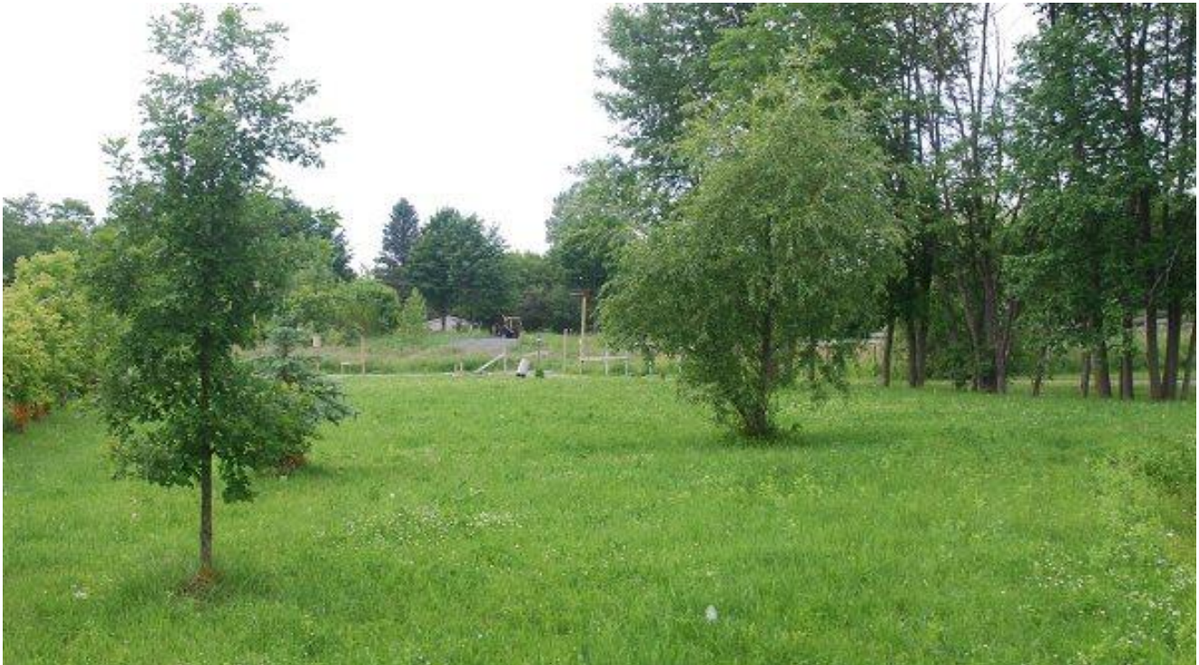
Reverse view, towards Bob Dylan lane (Allée)