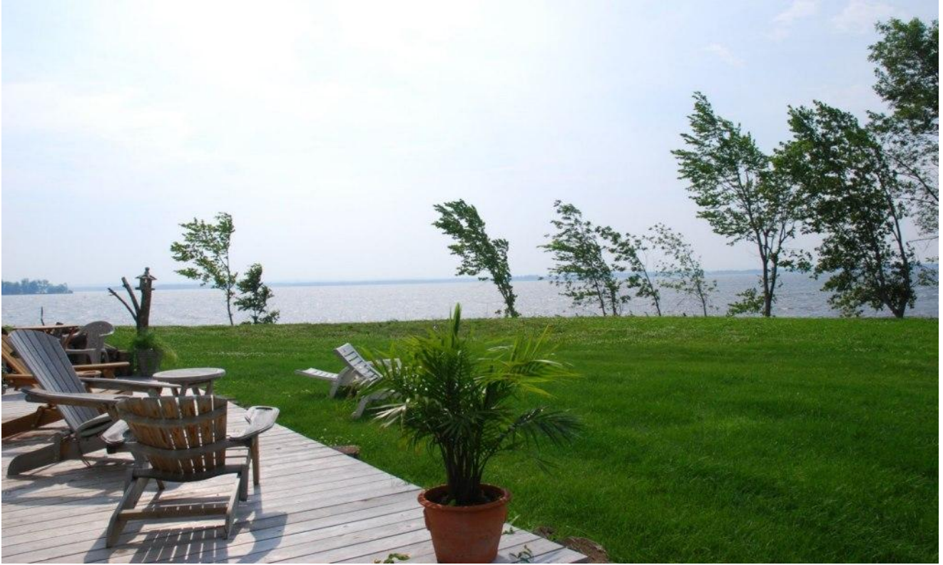
On a spring day, view from the south deck of the house

The house has stunning unobstructed views of the lake and the mountains of Vermont, with mature trees mostly on the sides and back of the property: