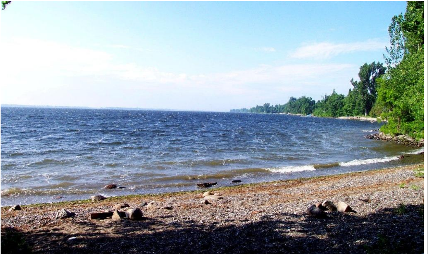
Your private beach on the lake (looking south)