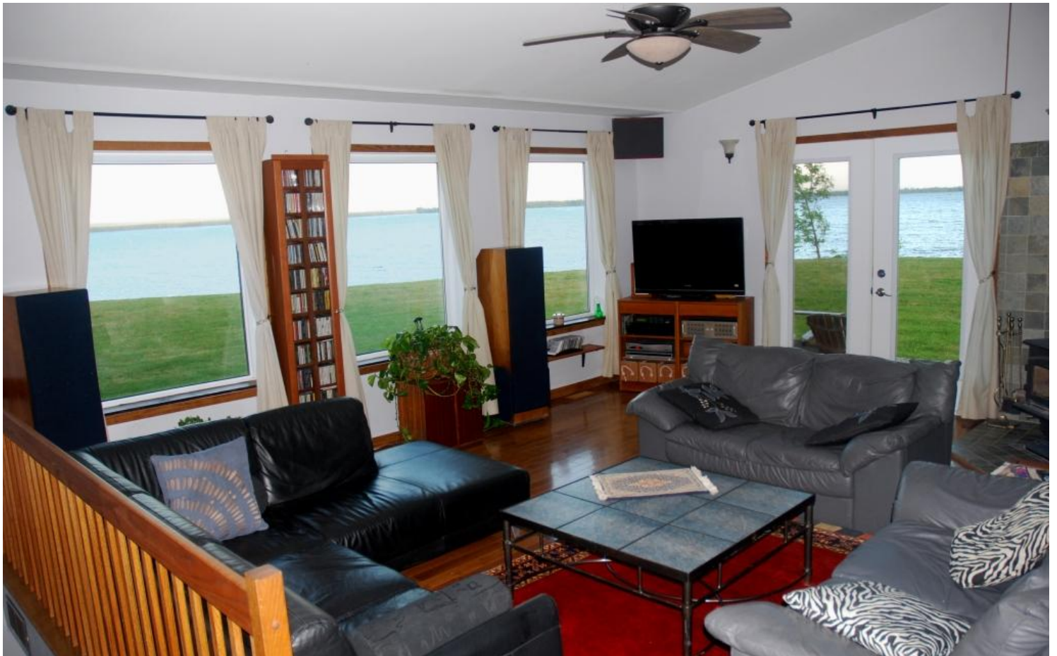
Main living room, entrance and wood stove

Designed by a talented local architect (Sonia Martel, Iberville, Qc), and built by professional contractors throughout, to the highest quality and insulation standards, this 4-seasons split-level cottage provides all modern amenities, and the same spectacular lake views can be enjoyed from most rooms in the house: